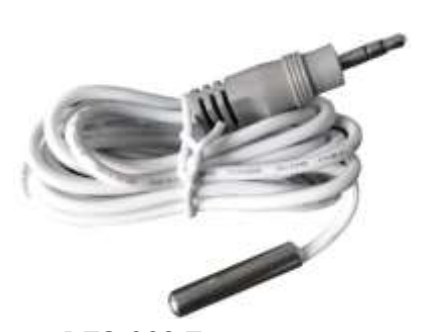
DTS-002 Temp sensor