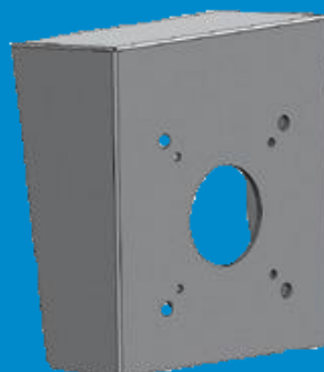
Weather Protection Hood