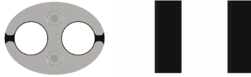
LV2545 Nestor Mech Seal 2 x 18mm basic assembly.