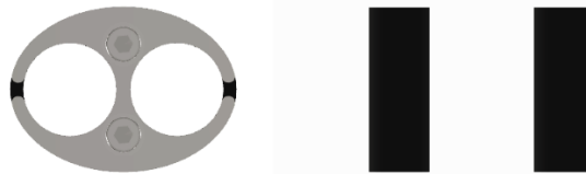
LV2546 Nestor Mech Seal 2 x 23mm basic assembly.