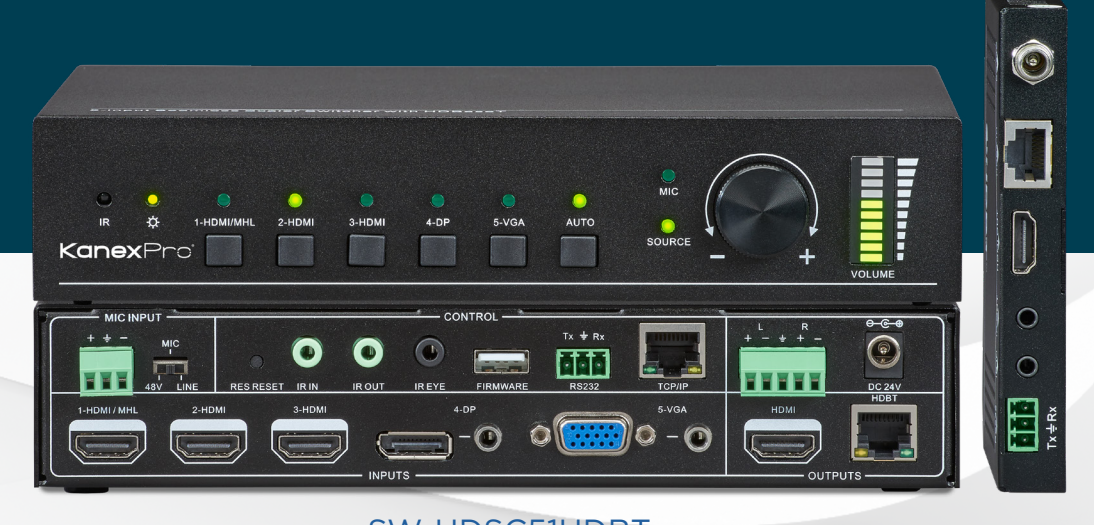
<u>SW-HDSC51HDBT</u> 5 Input Seamless Presentation Switcher over HDBaseT up to 230ft.

"We needed a device that would connect laptops, DVD players, document cameras and high resolution cameras while routing HDMI over CAT6 to several displays, allowing me to share our video and audio content by extending distances. Jay recommend the HDBaseT Seamless Presentation Switcher and Scaler <a href="SW-HDSC51HDBT">SW-HDSC51HDBT</a> from KanexPro and I was immediately impressed once I installed the product."