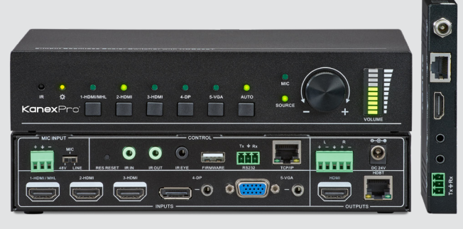
5 Input Seamless Presentation Switcher over HDBaseT up to 230ft.

The KanexPro Seamless Presentation Switcher and Scaler features five inputs, including HDMI, DP and VGA, with one local HDMI output and one HDBaseT output. Supporting instant switching with zero latency, the Seamless Presentation Switcher and Scaler is compliant with the latest HDCP 2.2 specs, supports CEC commands and EDID management, and the output can be extended with Power over HDBaseT (PoH) up to 230 feet. With a built-in audio de-embedder for HDMI and VGA inputs, the Seamless Presentation Switcher and Scaler includes an IR remote, as well as control via buttons, RS232 and web-based GUI. For more product information please click here.